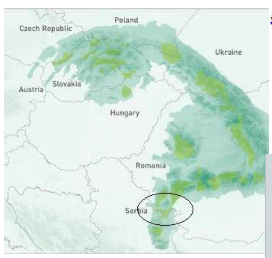
Iron Gates Nature Park (RO) / Djerdap National Park (SRB)