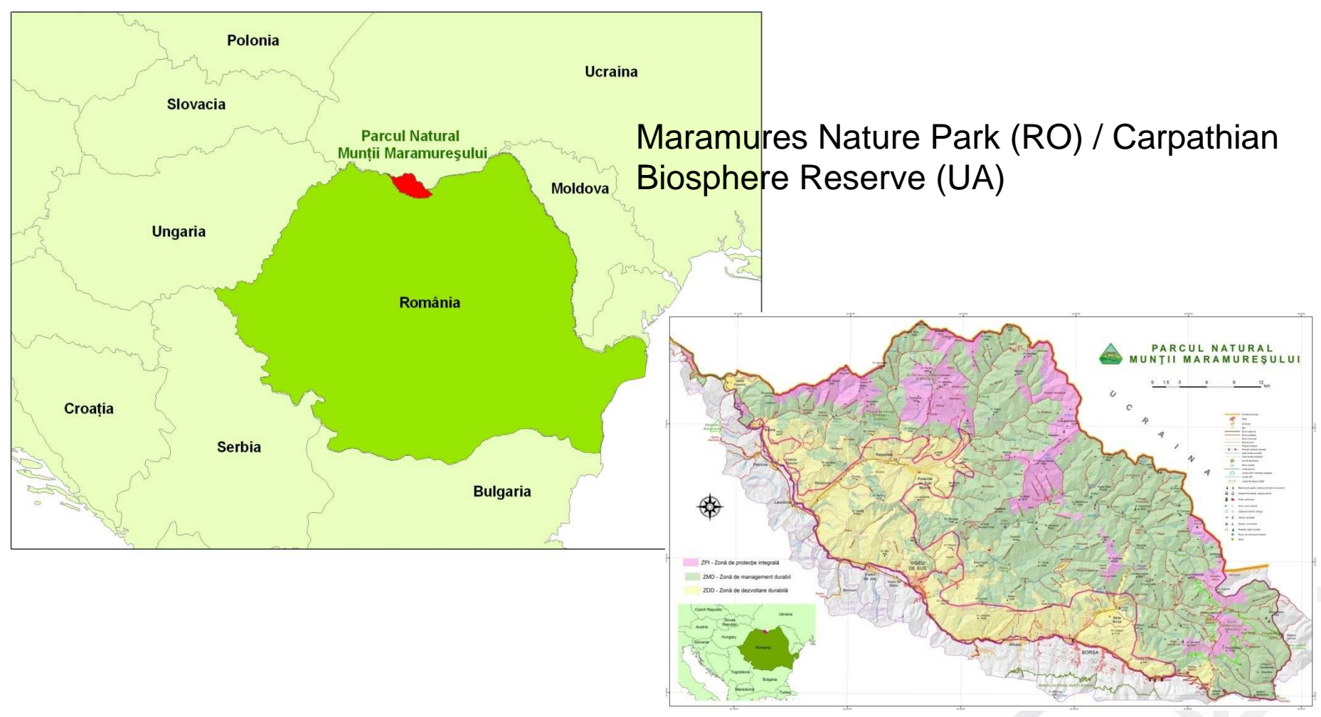
Jointly for our common future